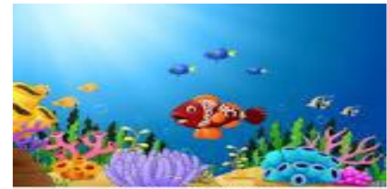
SPUCEETSTOCK.com = 6,95438861.